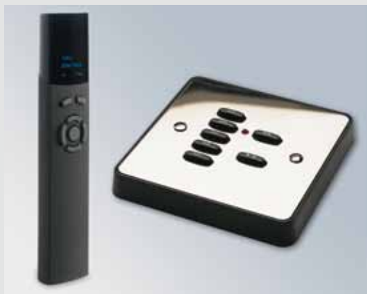
Remote controls Silent Gliss 0450

Our Customer Services team will be on hand from the start to offer expert advice on the most appropriate systems, control combinations and wiring for your project.